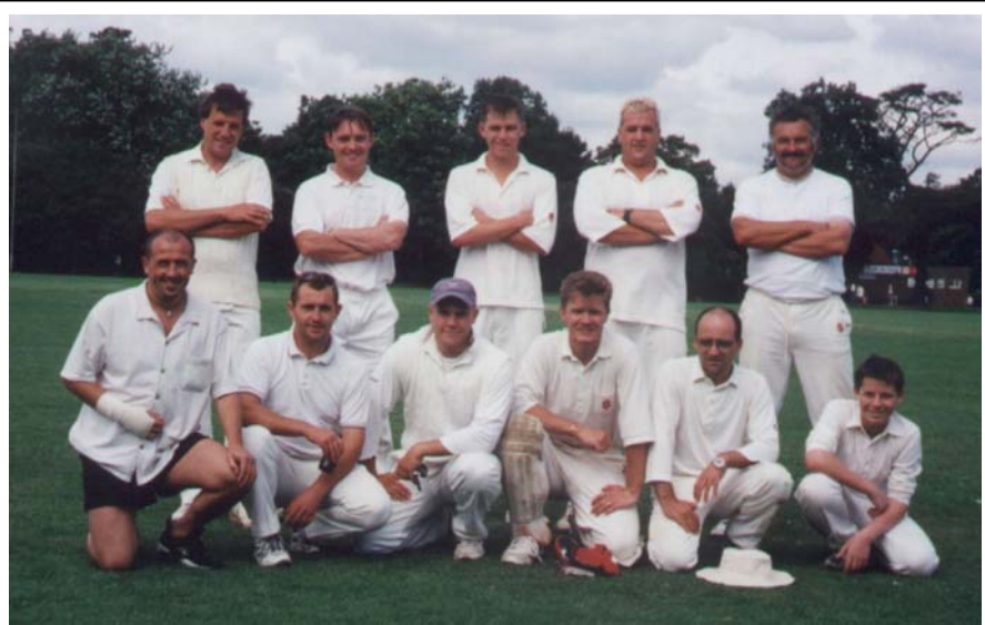
The Mighty Martlets v Hampden Park!

Well, that's it another season done and dusted. Doesn't time fly when your having fun! This season saw the Martlets play 33 matches to the end of August with the possibility of further matches into September. Fortunately so far only one match was abandoned due to the weather. Thanks to the fixture bureau a couple of cancelled matches were filled and blank weekends had fixtures found making ours a pretty full calendar with some new or re-discovered opposition.