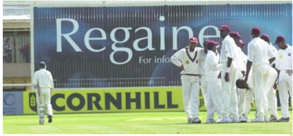
The real reason England can't beat the Windies....is that they're just too small!

It's about time I got the latest issue out, so here it is, the latest match reports and stats etc – all I can say is I've been just too wrapped up in this seasons cricket to put it all together.